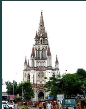
St. Joseph's Church - 1792, Trichy