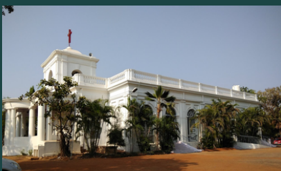
St John's Church - 1812, Trichy