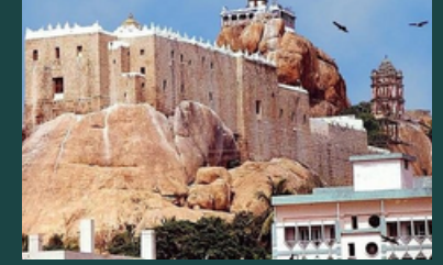
Tiruchirappalli Rock Fort